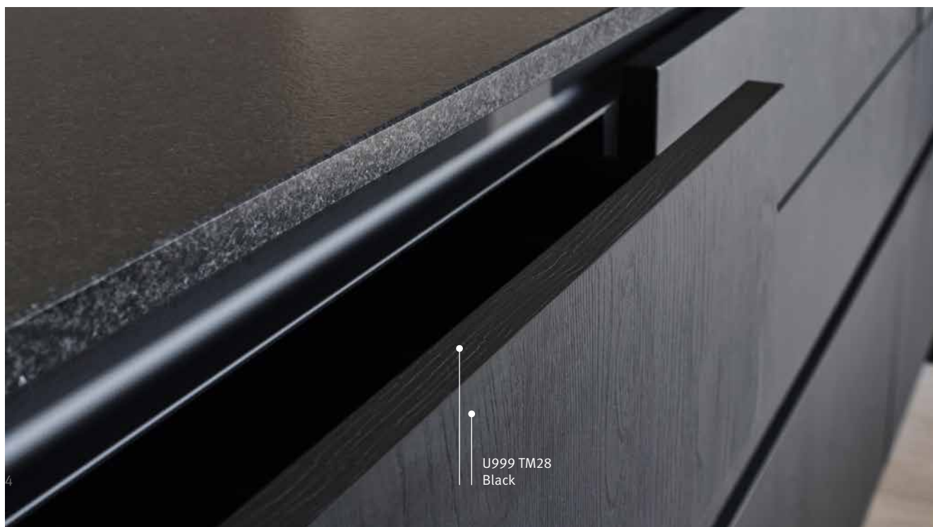
U999 TM28 Black

** Detailed information can be obtained from the sales representative in charge