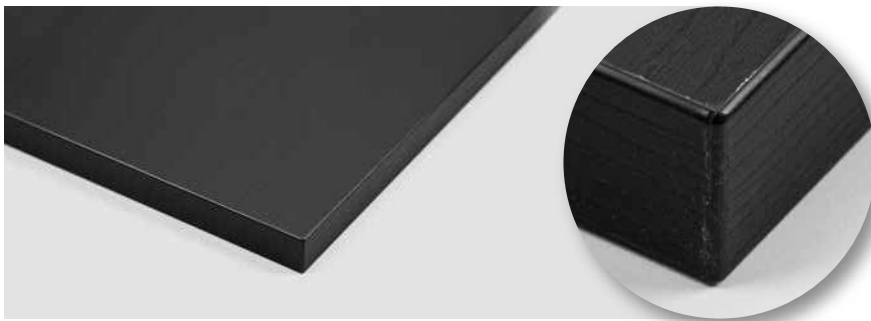
Conventional edging U999 TM28