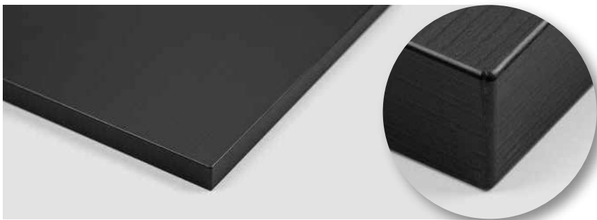
ABS Seamless Edging U999 TM28